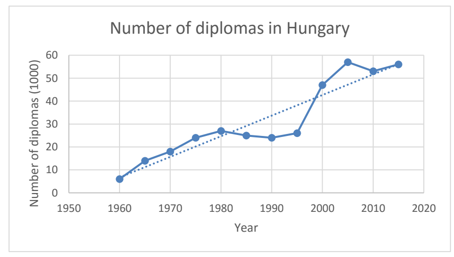
Figure 1: Number of diplomas from 1960 in Hungary [1]

In the last decades the number of students grew quickly in Hungary as well because working market needs more and more qualified people having diploma from higher education. Figure 1